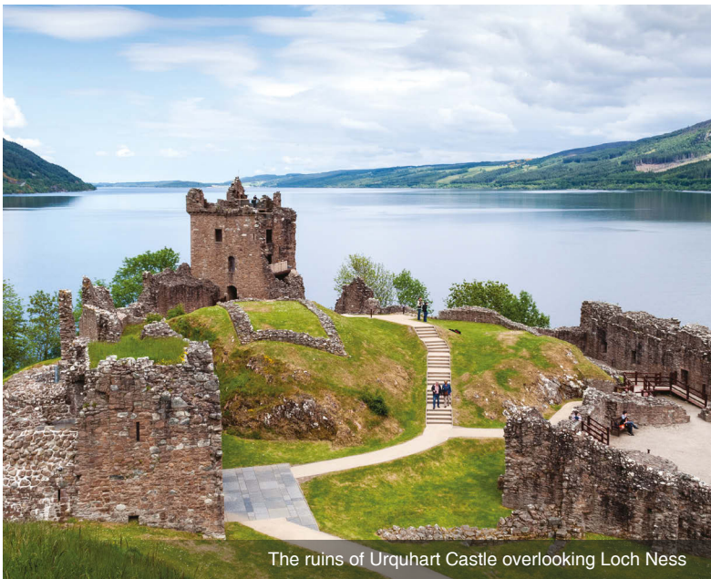
The ruins of Urquhart Castle overlooking Loch Ness

with dramatic scenery and striking architecture. During the panoramic city tour, see the historic Old Town and the elegant Georgian New Town, both UNESCO World Heritage Sites. Visit the city's icon, Edinburgh Castle, perched high atop a hill, offering panoramic views of stately mountains, rolling hills and lovely countryside. Inside the castle, stand in awe of the Scottish Crown Jewels, featuring the crown, sword, and scepter, which are among the oldest regalia in Europe. After free time for lunch on your own, depart for Roslin, a tiny village outside Edinburgh, where you visit Rosslyn Chapel. This 15th-century church is famous for its decorative art and mysterious associations with the Knights Templar and the Holy Grail. This evening, dinner is included. Meals: B, D