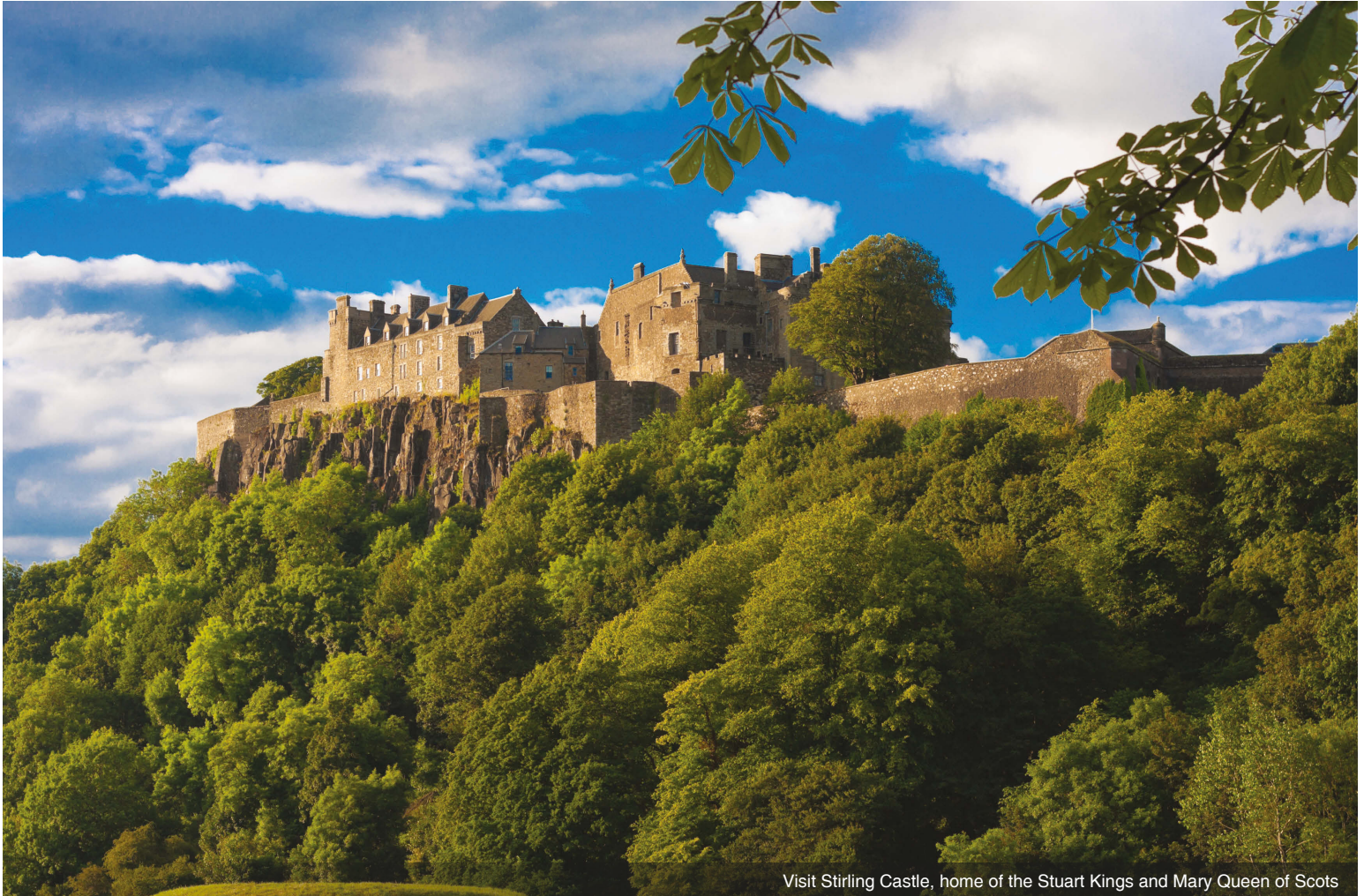
Visit Stirling Castle, home of the Stuart Kings and Mary Queen of Scots