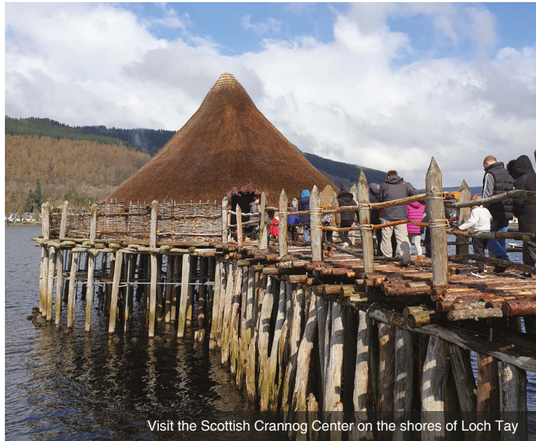
Visit the Scottish Crannog Center on the shores of Loch Tay

DAY 1 Depart the USA: Depart your gateway city on an overnight flight to Glasgow, Scotland.