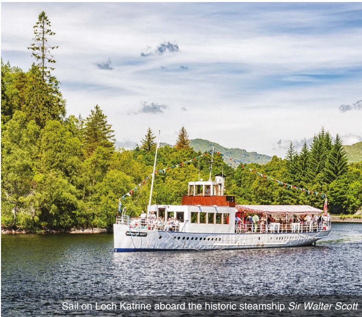
Sail on Loch Katrine aboard the historic steamship Sir Walter Scott